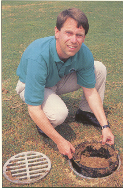
The siphons are one-foot diameter basins with grates to remove surface water.

siphon from the drainage basin." Once the water has been drained, the system is designed to stop draining so water remains in the system and keeps it primed.